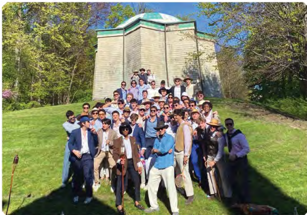
Brotherhood pictured in front of the Goat House during the annual Derby Formal.