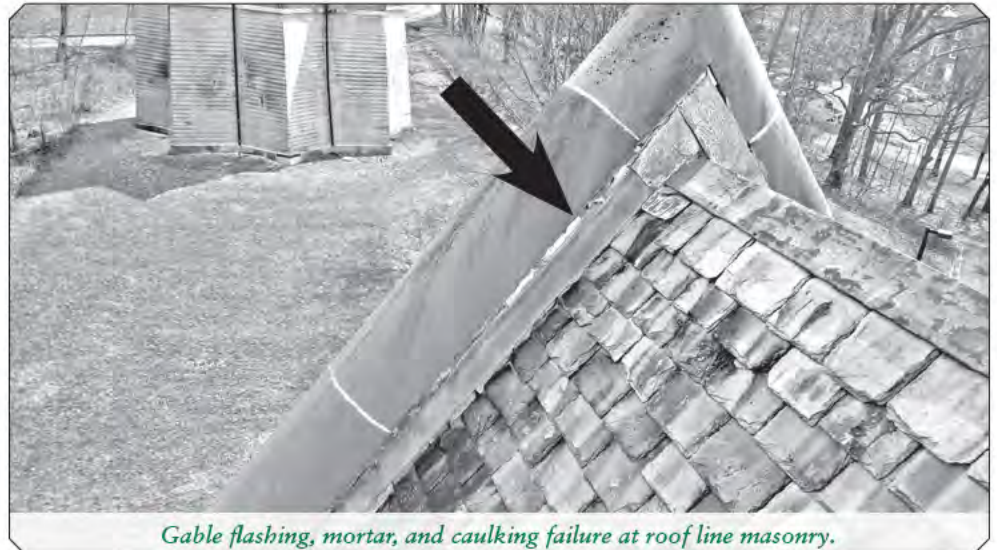
Gable flashing, mortar, and caulking failure at roof line masonry.