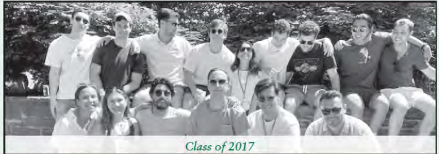
Class of 2017