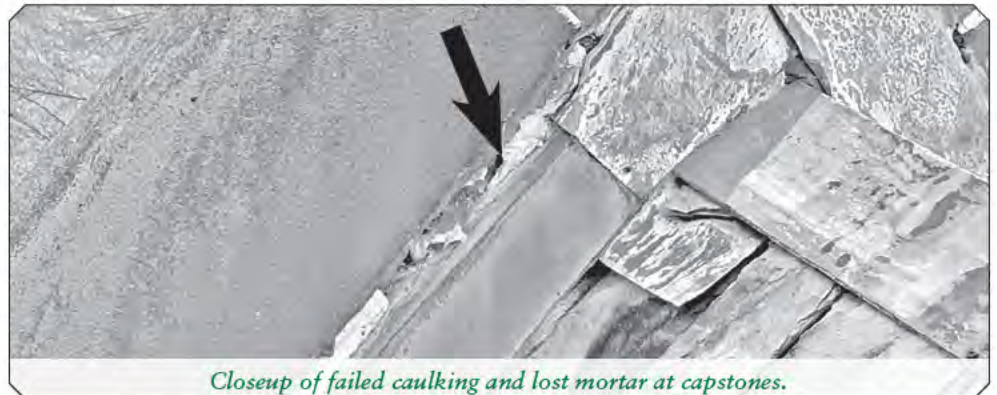
Closeup of failed caulking and lost mortar at capstones.