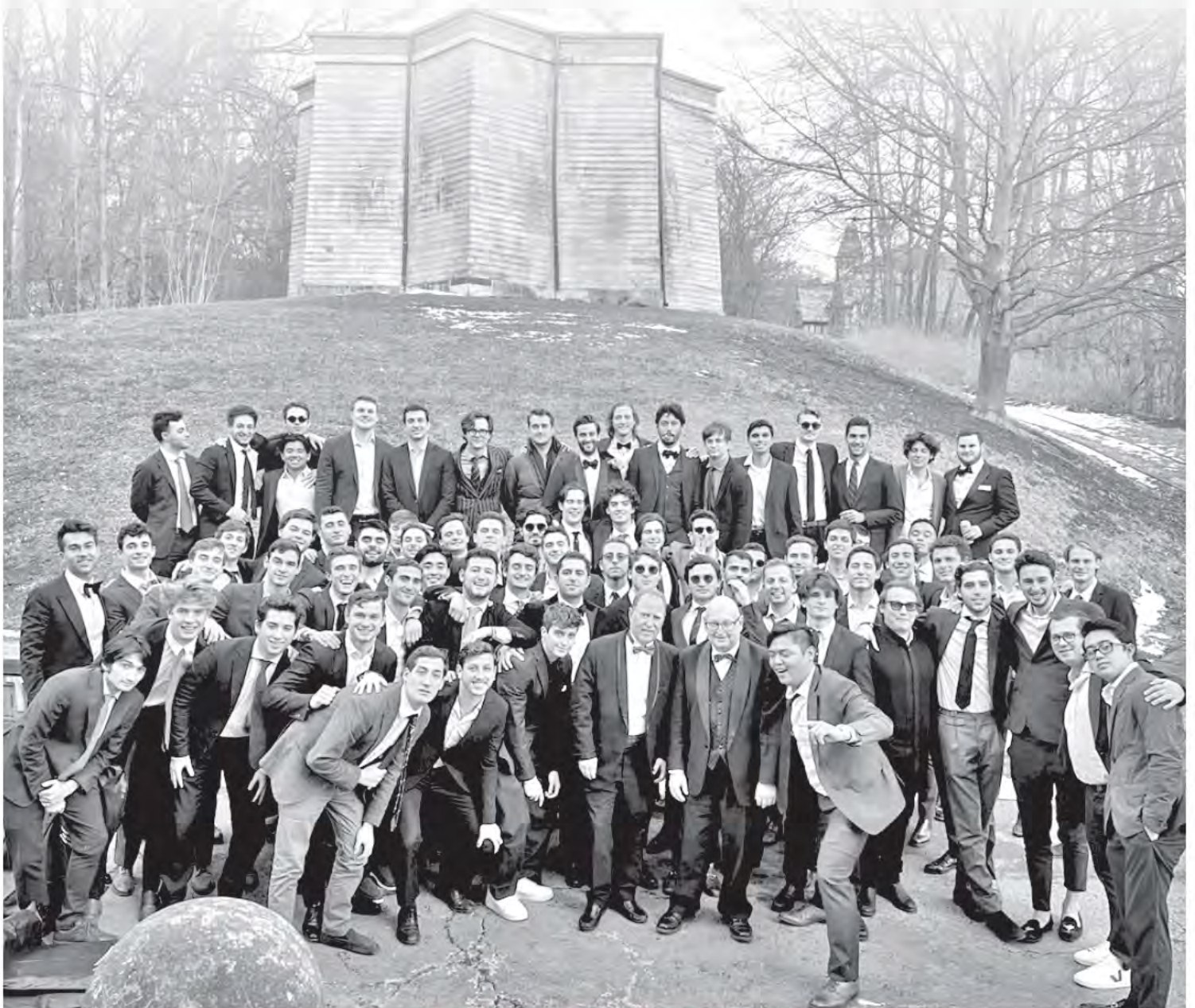
Our newest brothers at 2022 spring initiation.