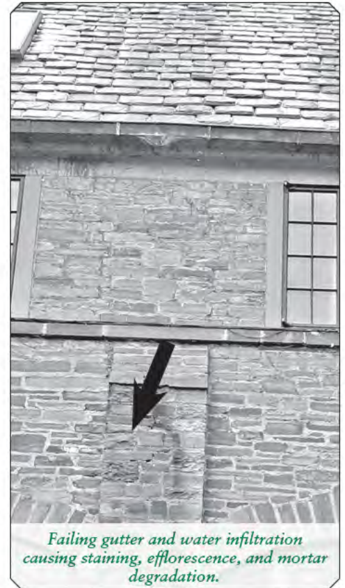
Failing gutter and water infiltration causing staining, efflorescence, and mortar degradation.