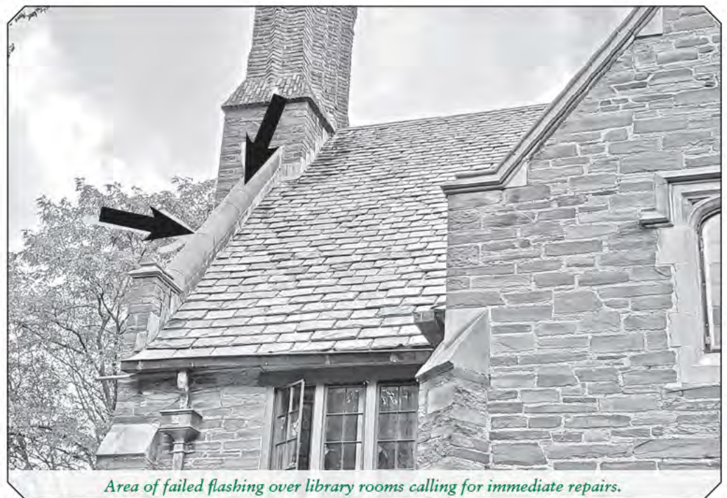
Area of failed flashing over library rooms calling for immediate repairs.