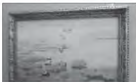
The "Duck Marsh Scene" painting.