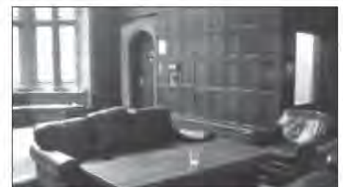
Keep up the good work!