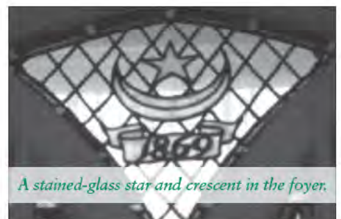
A stained-glass star and crescent in the foyer.