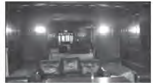
It doesn't get much better!