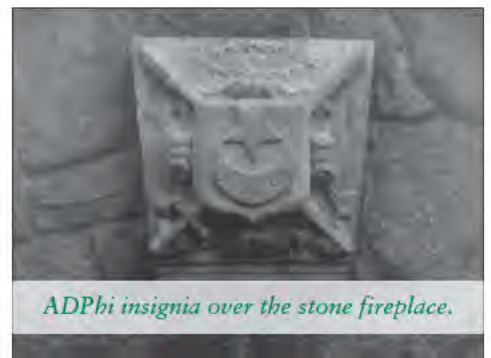
ADPhi insignia over the stone fireplace.

In the bar, they had a binder with the history of Alpha Delt included in it. The proprietor had done some of her own research, but was a sponge as to more of its history, the meaning of the symbols (including the sword and spear), etc. I told her I would prepare some additional info and send it on in a more formal “package”